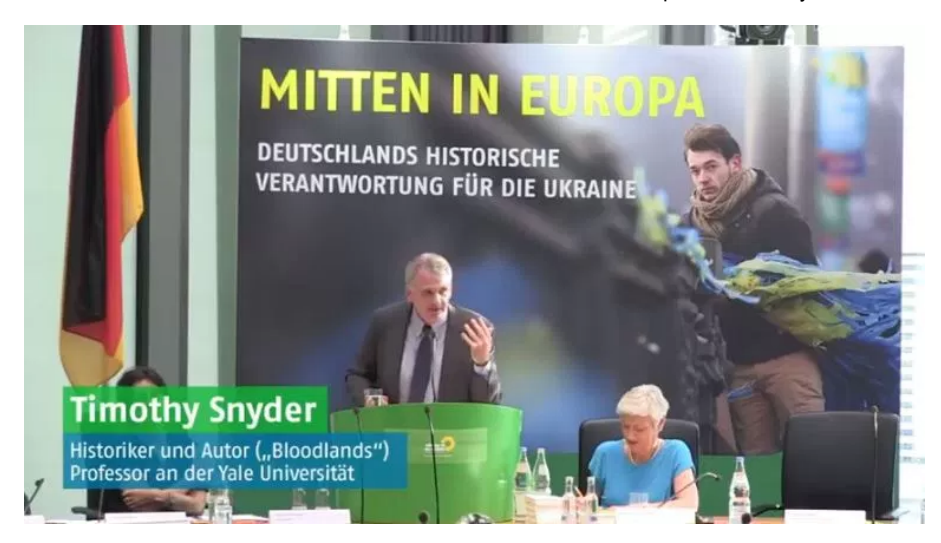
Screenshot from the video