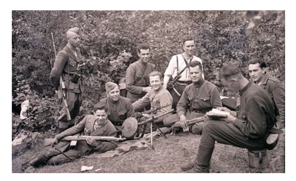
The Ukrainian Insurgent Army, or UPA, which following a brief period of collaboration with Nazi Germany, fought against both the Soviet Union and the Wermacht for an independent Ukraine, was vilified in Soviet time

Ukraine after WWII, and for the Russian invasion of Ukraine in 2014.